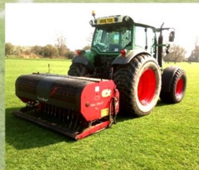
Verti-draining improves drainage, grass sward growth and relieves compaction.