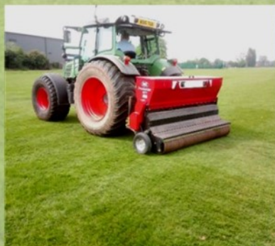
Over seeding to improve grass coverage, and to prevent moss and weed invasion.