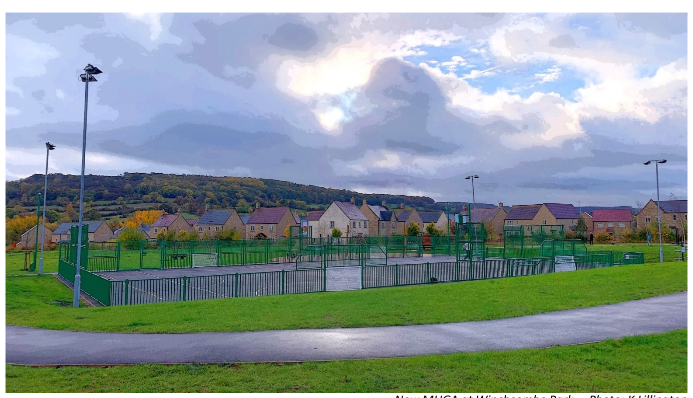
New MUGA at Winchcombe Park

Working to Improve Sport and Play Facilities in Gloucestershire and South Gloucestershire